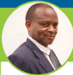
CIA. BAPTISTER G. MGAYA Governor