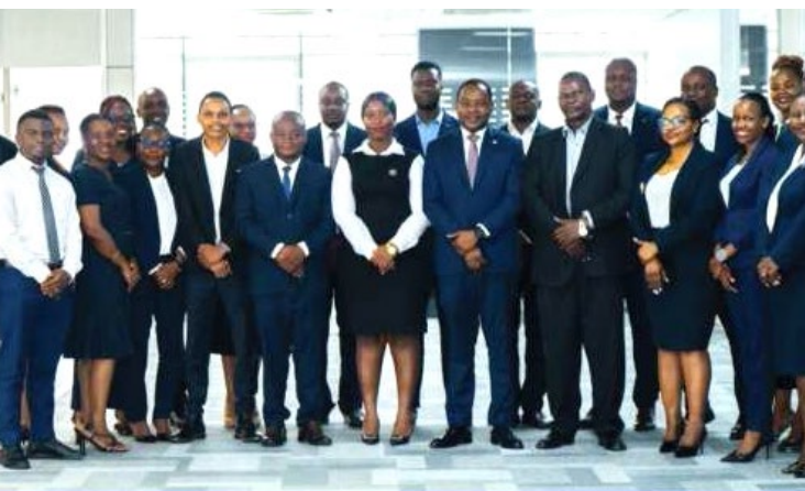
Members of IIA Tanzania Board of Governing Council with NMB Bank Plc Internal Auditors during the May Internal Awareness Month at the bank.

At NMB Bank Plc, and within the broader community of the IIA Tanzania, the focus remains steadfast: promoting excellence in internal auditing through continuous development, ethical conduct, and the adoption of cutting edge practices. As we move forward, let us carry these insights with us, ensuring that our roles as internal auditors are not only preserved but also enhanced in an ever-evolving business landscape.