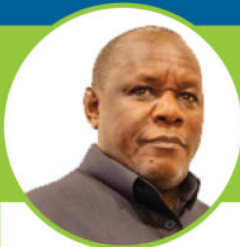
MWANYIKA SEMROKI Governor