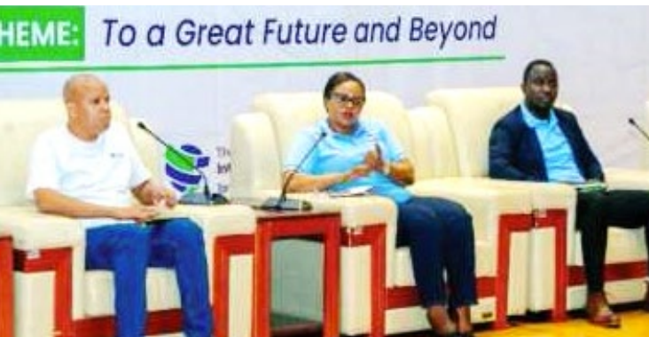
The internal audit Kickoff was a remarkable success, leaving a lasting impact on all participants and fostering a deeper understanding of the internal auditing profession.