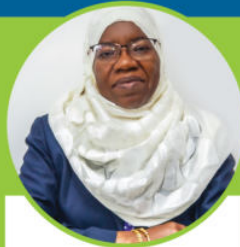
HADIA SALUM Governor