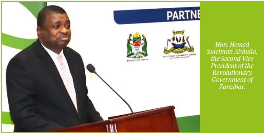
Hon. Hemed Suleiman Abdulla, the Second Vice President of the Revolutionary Government of Zanzibar.

Hon guest of honour said the government recognizes and fully supports the crucial role of internal audit and that is dedicated to strengthening and empowering the profession to foster the culture of accountability across all institutions.