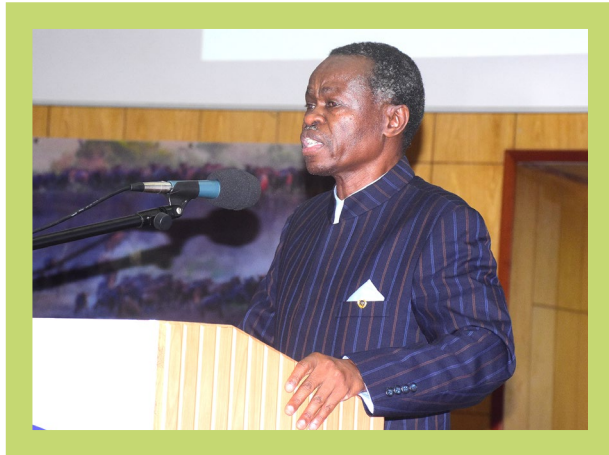
Prof. PLO Lumumba, a renowned Pan-African and legal expert delivered a keynote address during the 10th AFIIA Conference in Dar es Salaam.

Prof. PLO Lumumba, a renowned Pan-Africanist and legal expert, delivered the keynote address, "Beyond Boundaries: Make the Difference." His speech was a clarion call for internal auditors to embrace a more strategic role in organisations, moving beyond traditional compliance functions to becoming key drivers of organizational transformation. Internal auditors must be visionaries, identifying emerging risks and opportunities to guide organisations toward sustainable growth.