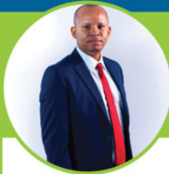
CIA. GEORGE BINDE Governor