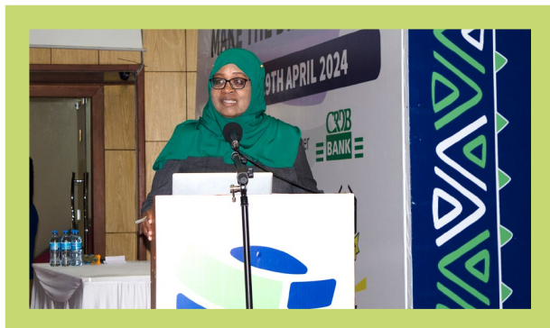
Hon. Dr. Saada Mkuya Salum (Minister of Finance, Revolutionary Government of Zanzibar) was the guest of honor for the AFIIA Governance Forum.