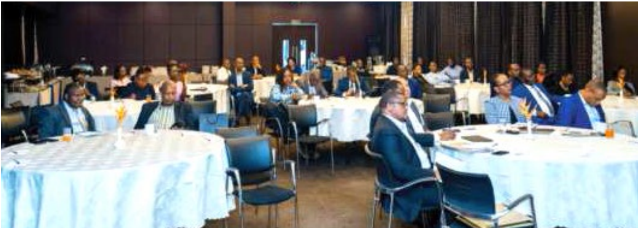
Elevating impact and transcending boundaries at the CAE Breakfast Forum at the Protea Hotel Marriott, Dar es Salaam. A session filled with knowledge sharing, networking, and celebrating the audit profession.